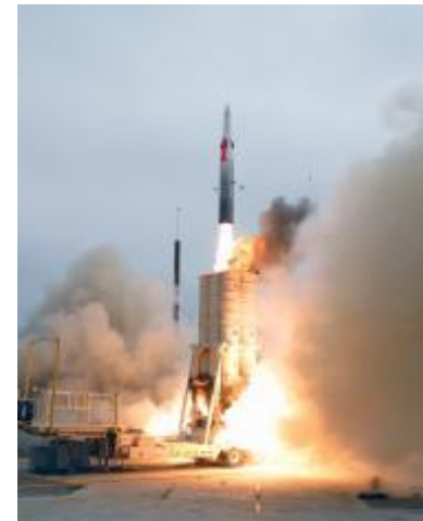
Arrow 3 Anti Ballistic Missile Defense System