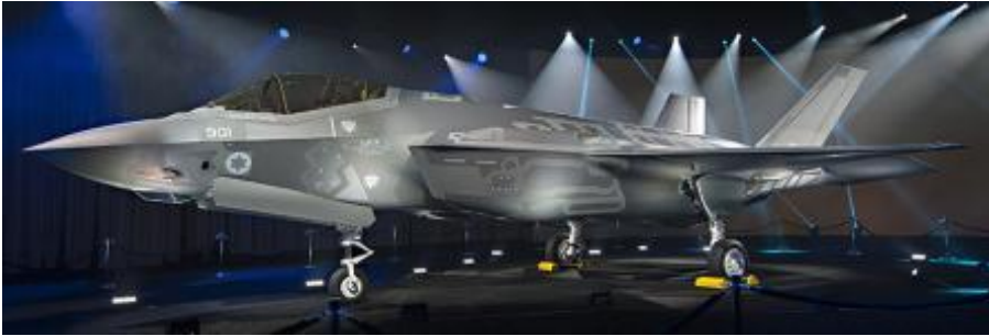
Israeli F-35 Program