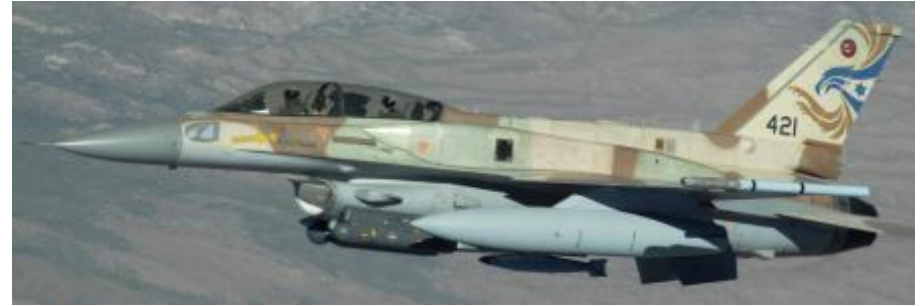
Israeli F-16I Program