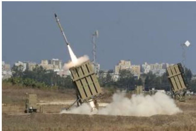
Iron Dome Missile Defense System